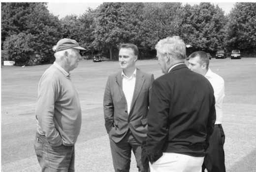
Former England International Graham Thorpe opened the redeveloped pavilion in 2009, pictured on the main square