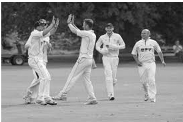
GOT HIM, the 1st XI celebrate a wicket!